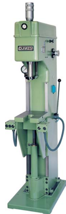
2. Pneumatic open-fronted press with adjustable table, sensitive handlever control, can be switched to 2-hand operation